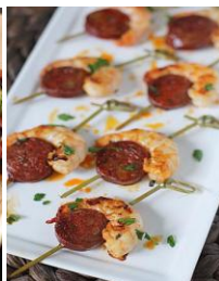
Shrimp & Sausage Bites