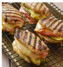
Cuban Pork Chops