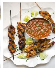
Thai Chicken or Pork w/ sauce

So if you are thinking of that backyard barbecue or about that one special day and you need catering to fit your theme or special requests please contact us and we can make your party one to remember.