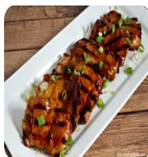
Huli Huli Chicken