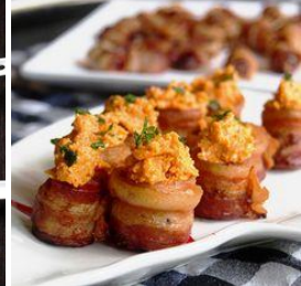
Pig Bombs-Smoked Kielbasa Wrapped in Bacon and Topped with Pimento Cheese