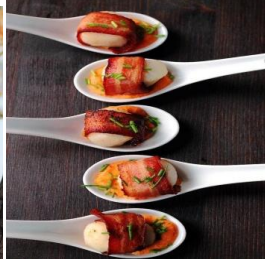
Bacon Wrapped Scallops in a Cajun Cream Sauce