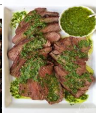
Argentine Steak with Chimichurri