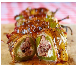
Bacon Wrapped & Brisket Stuffed Jalapeño Poppers