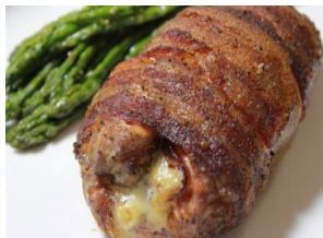
Smoked Chicken Cordon Bleu