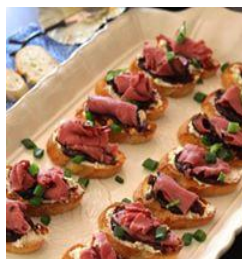
Smoked Roast Beef Crustini